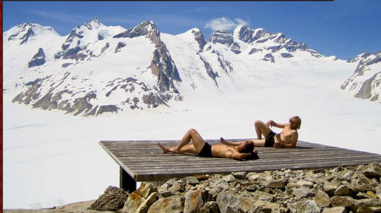
TOP: RANDO ROOTS; FINISHING THE PATROUILLE DES GLACIERS. MIDDLE: CLARK KENT ON QUALITY CONTROL. BOTTOM: REFUELING ABOVE THE ALETSCHE GLACIER, SWITZERLAND.